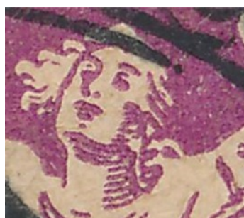
Mail Order Detail