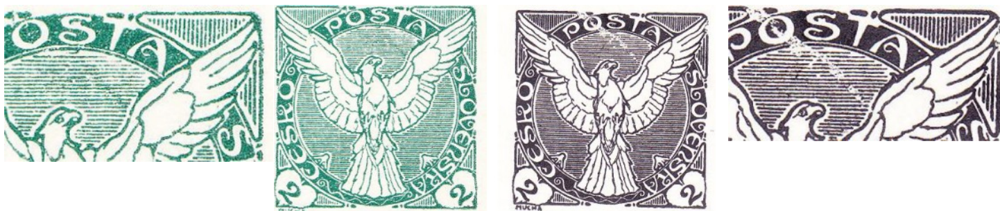
Left: TD 5, ZP 96.

On ZP 96 TD 5, the upper right corner and background lines under the inscription POŠTA are deformed. These features of ZP have so far been considered as plate flaws caused during the production of the printing plate by etching. However, the finding of a trial print in black on coated paper proves that this is a retouch of the original's much more striking defect.