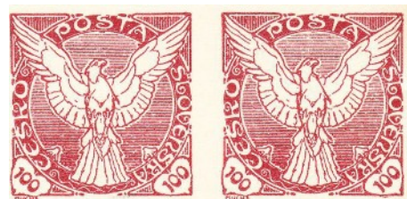
ZP 64 Type I