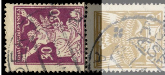
Computer assembly of Figs. 1 and 5

Figures 2 and 3 show stamps with the same perforation deviation without determining their position. The summary study for the olive 10 haler shows defects on ZP 24, 44, 64, 74, and 84, but these are not on the attached specimens. Even the pair (Fig. 4) does not show typical defects. It is certain that it comes from columns 4-94 and 5-95.