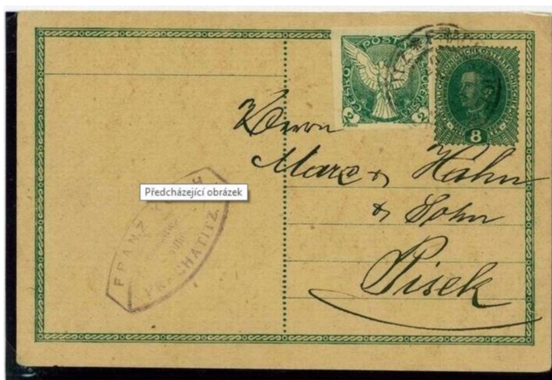
2 Haler newspaper stamp used to up frank an 8 haler postcard.

Translator's Note: The Czech text in the white boxes on the two pieces simply refers to their sequence and does not relate to the material itself.