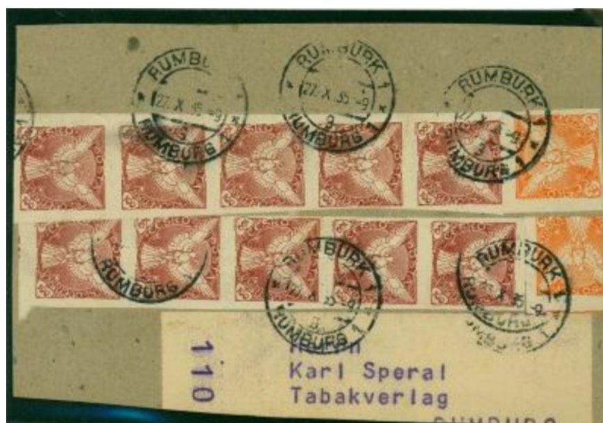
Combined Franking of 1100 Haler. 110 copies up to 200 g, or up to 100 g with attachment