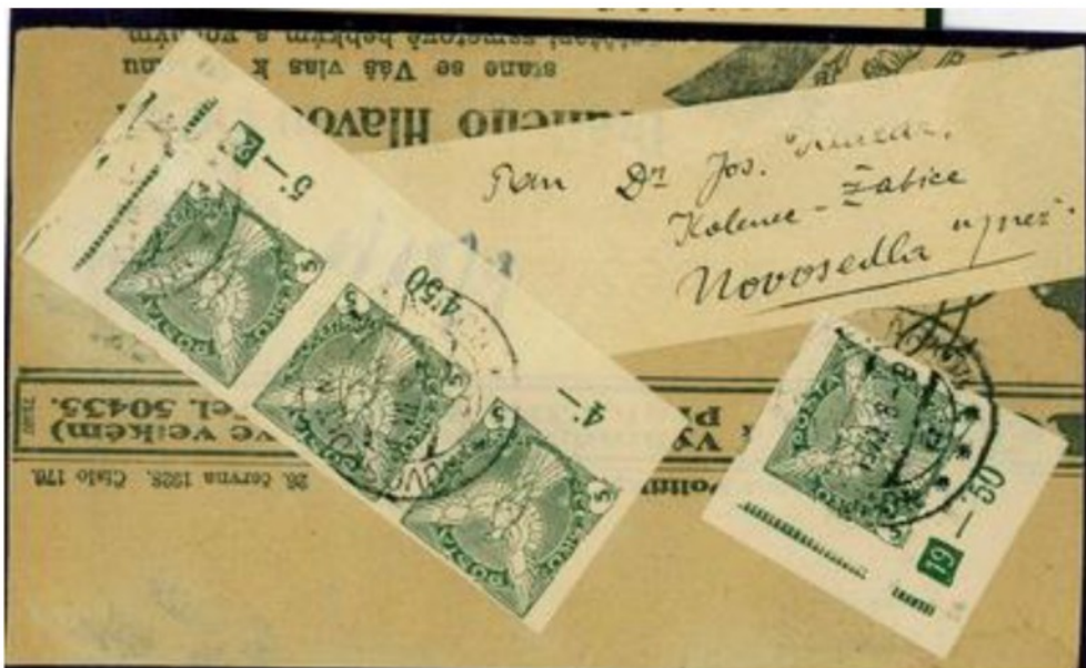
Quadruple Franking of 20 Haler. Plate mark 19-28. 4 newspapers up to 100 g