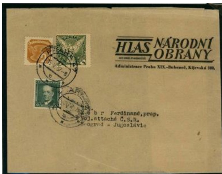
Mixed franking with two newspaper stamp issues and a 50 haler postage stamp - sent to Yugoslavia