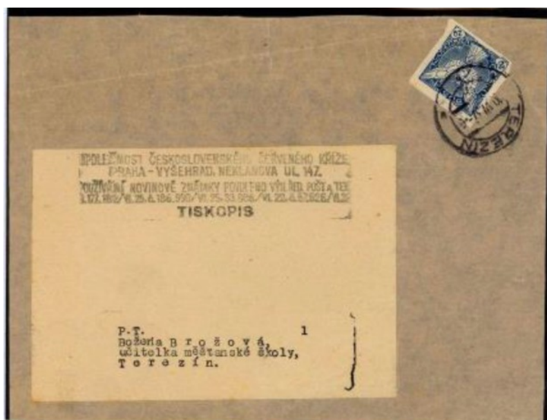
Single-Stamp Franking 20 haler. This unusual use of a newspaper stamp for sending printed matter in an envelope was permitted with a special permit.