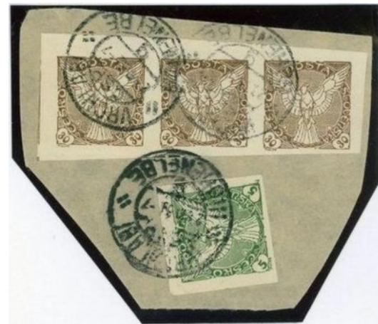
Clipping with 30 Haler Paired Types

The franking corresponds to 6 copies. Note mail is for 8 copies, 4 haler paid in cash.