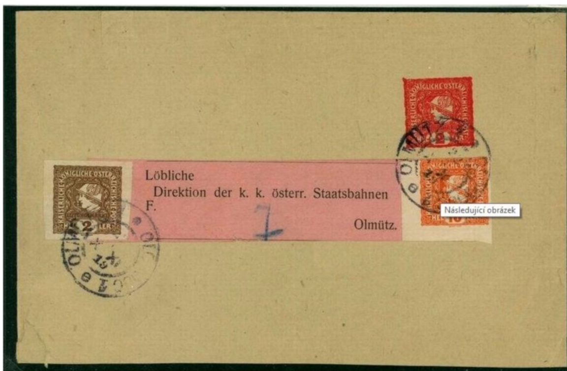
Use of parallel newspaper stamps of Austrian origin from 1916 in the territory of Czechoslovakia February 22, 1919.