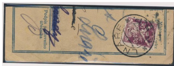
The right part of a postal order sent from the post office of Lnáře 29.VII.1920

We dealt with the covers having single-stamp frankings of the Holubice and Osvobozená Republika stamps in Bulletin 47/1998, 50/1999, 63/2006, and 69/2008. Although the depicted postal money order (PP) is not, according to philatelic nomenclature, a typical cover, it is in any case a relatively rare document of the single-sign use of the Osvobozená Republika 30 haler stamp.