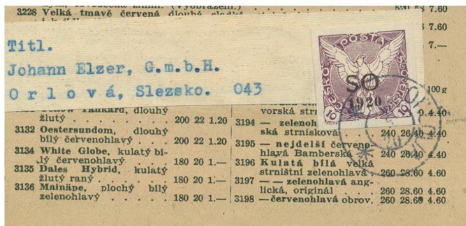
Newspaper Wrapper with 10 Haler Stamp. SO 1920 Overprint. 5 newspapers.