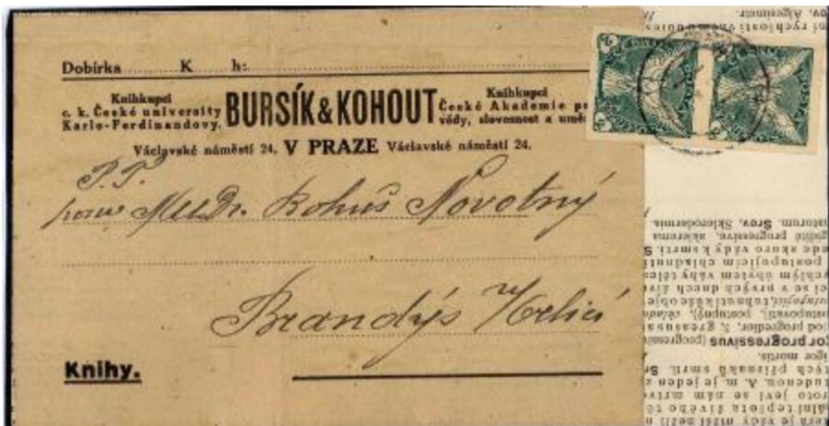
Double franking of 4 haler for 2 newspapers up to 100 g