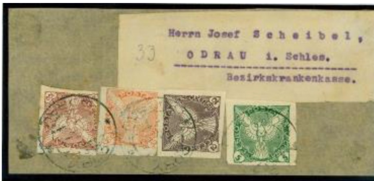
Mixed (4 Colour) Franking. 165 haler - 33 copies up to 100 g.