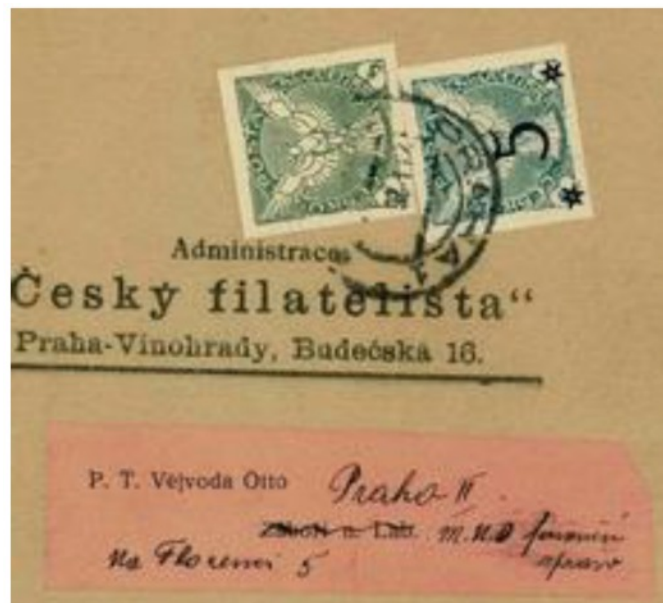
Mixed 5 Haler Franking.