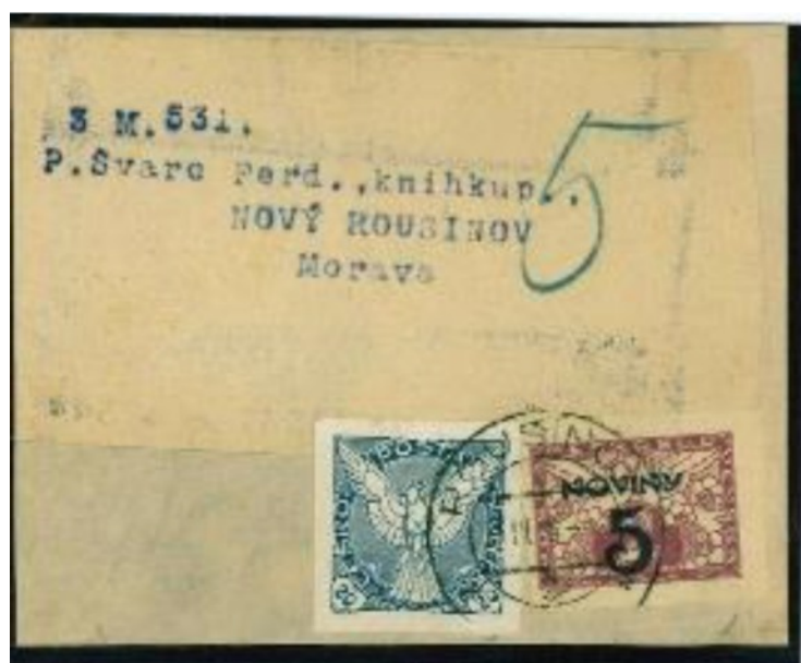
Mixed Franking of 25 Haler. 5 newspapers up to 100 g. Note use of overprinted express stamp.