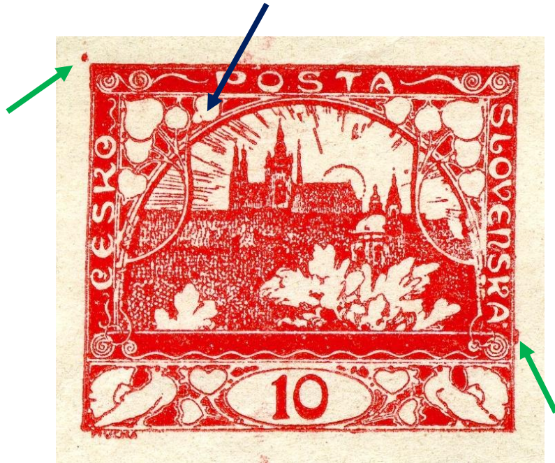
Pos 12 plate 2 - stamp Dot by corner Dot on frame