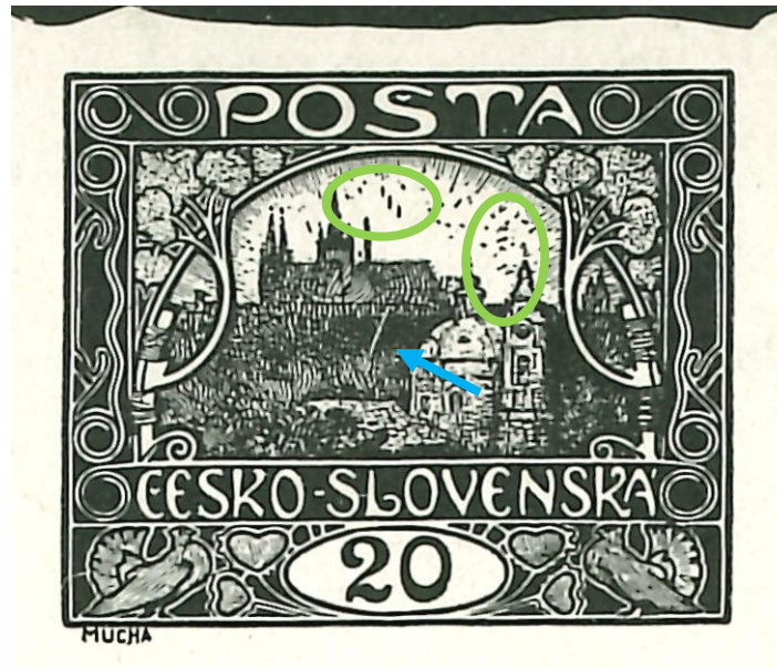
Plate III pos. 6 – black print