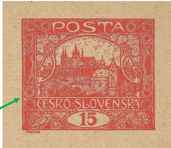
Plate VII-pos 8 as stamp and from card