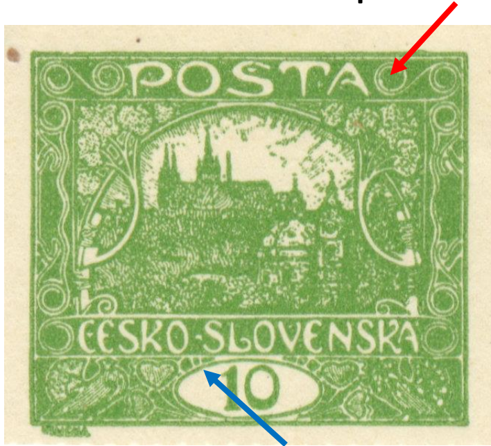
Plate II pos 1 - stamp Dent in oval (negative) Dot in 6th spiral (specific)