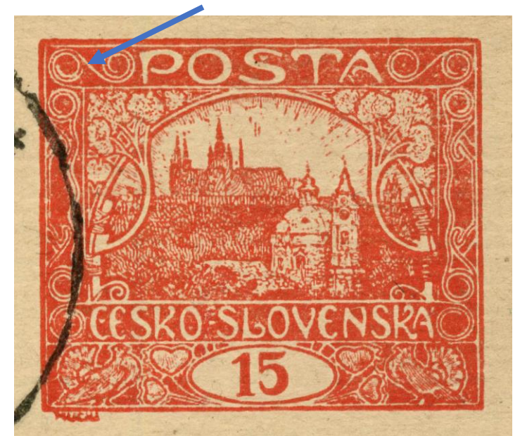
Plate VIII: open spiral