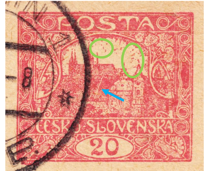
Plate IV pos. 6 – CDV22