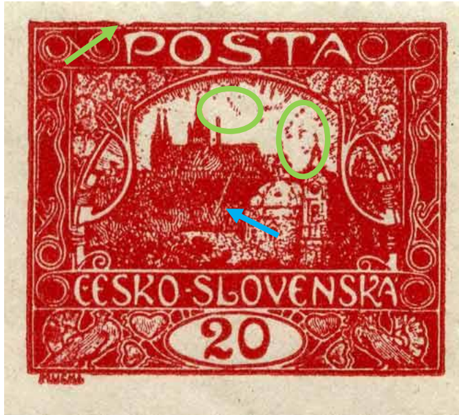
Plate I pos. 6 - stamp