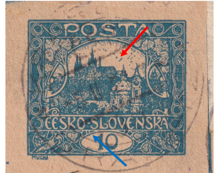
Plate III pos 1 – CPP15 Dent in oval (negative) Rays in sky (specific)