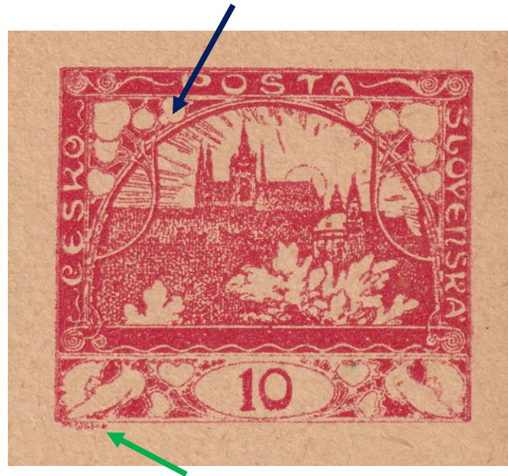
Pos 12 plate 5/6 A – CDV07 A of Mucha forms dot