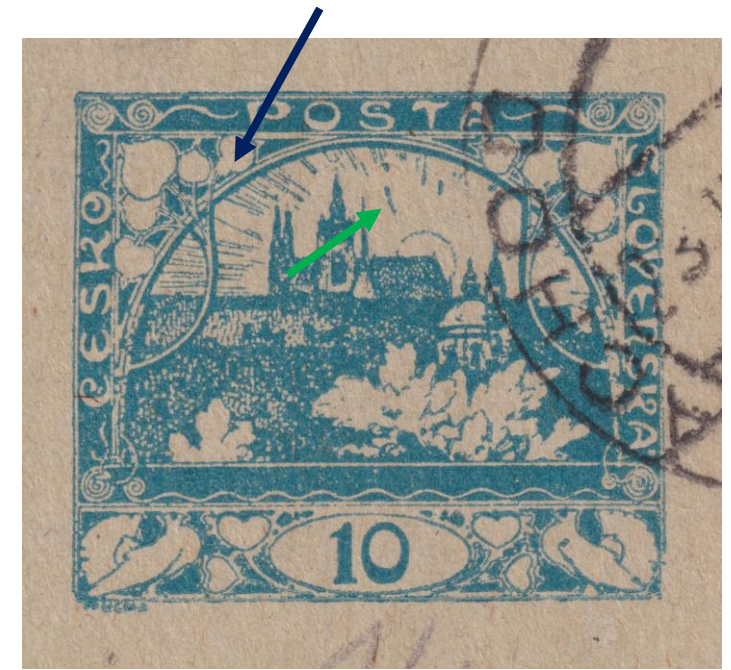
Pos 12 plate 5/6 B – CDP02B Short and broken main ray

Up to now 166 (out of possible 200) dies found used on postal stationery and described