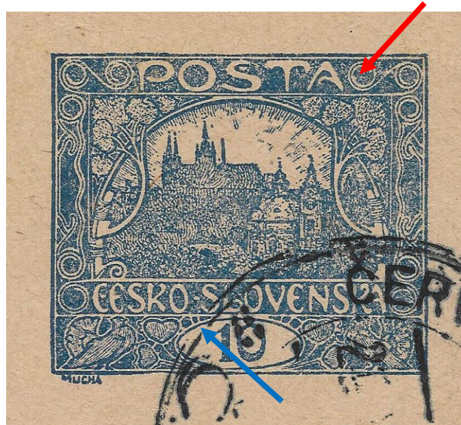
Plate II pos 1 – CPP16 Dent in oval (negative) Dot in 6th spiral (specific)