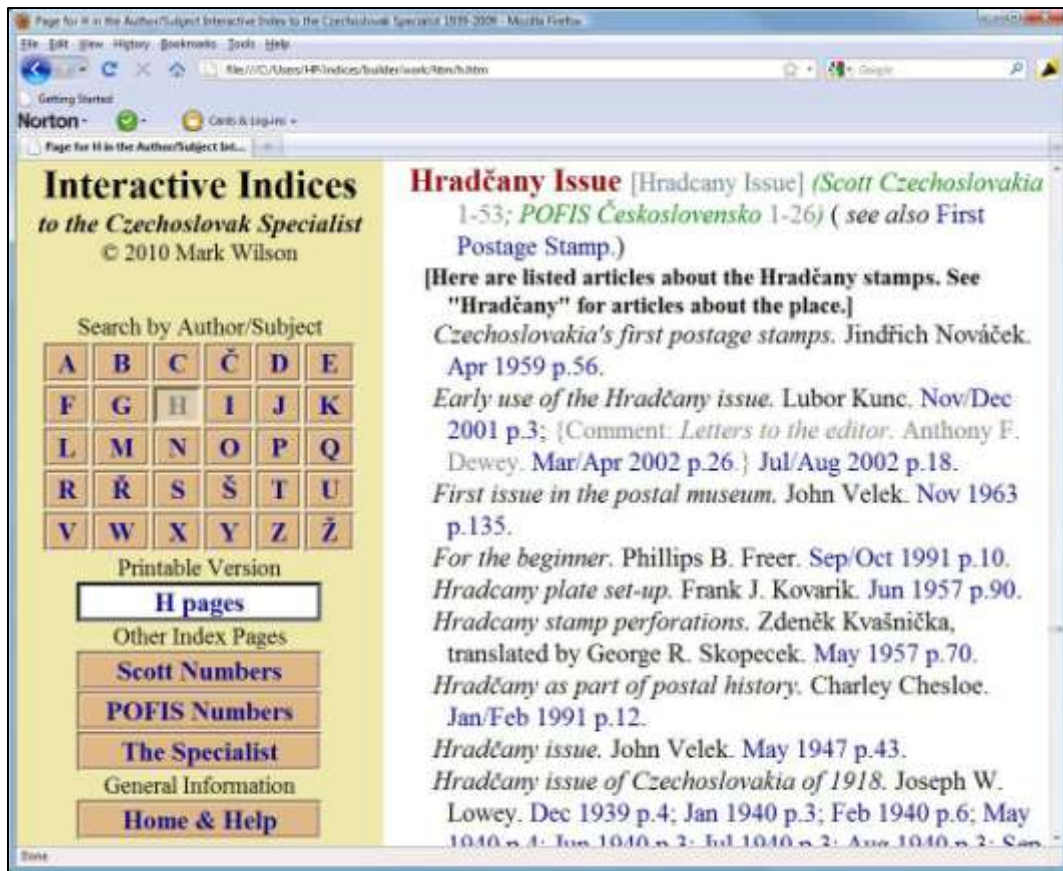
Figure 2: The Author/Subject Pages.

The Author/Subject pages may be reached from any page by clicking on the Author/Subject button on the navigation sidebar.