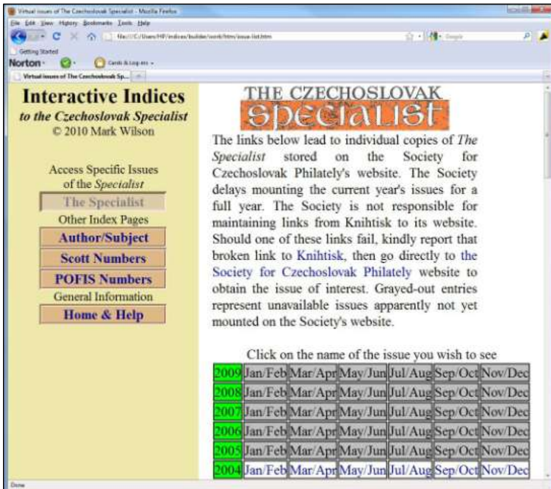
Figure 5: Access a Specific Issue Page

Sometimes the indices are not required. When the year and issue of a specific Specialist is already known, access this page from any other by clicking on The Specialist button in the navigation bar.