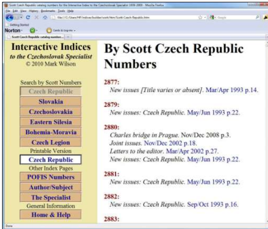
Figure 4: Scott Catalog Number Pages

The Scott Catalog Number Pages may be reached from any other page by clicking on the Scott button found on the navigation sidebar. Each of the Scott catalog segments listed on its page's navigation sidebar may be opened by clicking on the respective button.